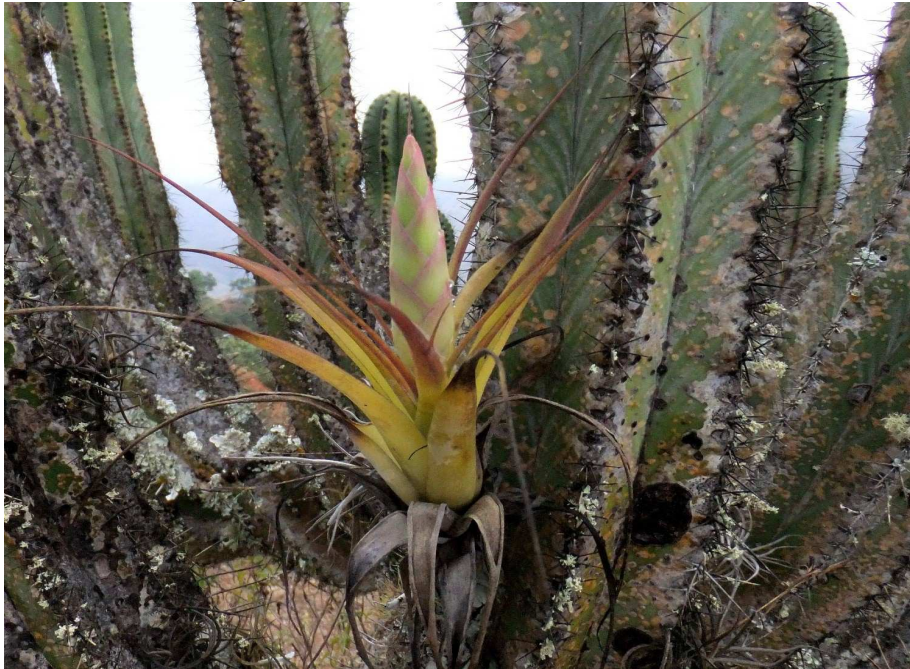
Tillandsia achyrostachys on cactus

A power point survey of this group of plants, the evolutionary extreme development of bromeliads, which derives water and nutrients only through their leaves, using their roots, if they grow any, only to attach to rock, tree bark, power lines. Stunning photos of their habitat provide valuable clues for care.