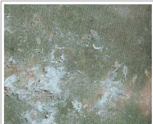
Mealybug egg masses

On the right are brown circles which are young scales. As they grow older the circle rises to form a hump which becomes blackish. These scales can easily be rubbed away with one's finger.