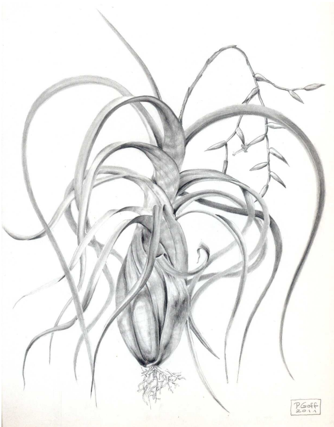
Tillandsia flexuosa , 1788, epiphytic in Florida, West Indies, Panama, Venezuela, Colombia, Guiana, up to 600 m above sea level