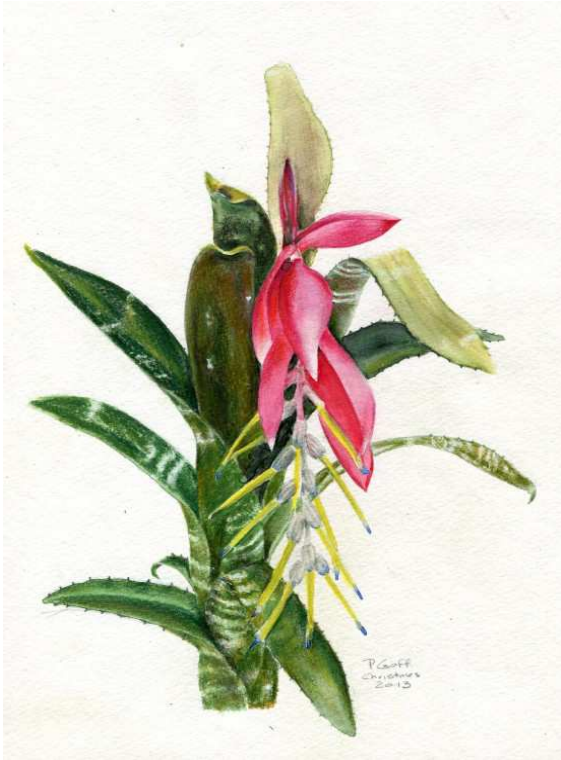
Billbergia 'Jingle Bells'